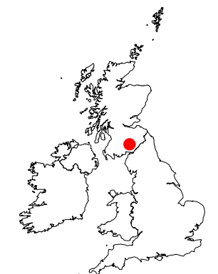
SITE LOCATION - NOT TO SCALE