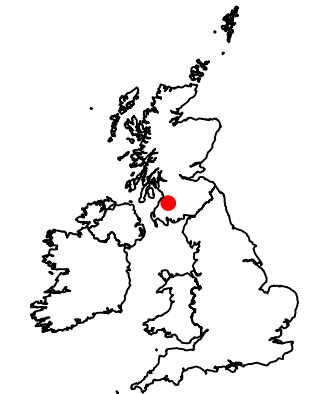
SITE LOCATION - NOT TO SCALE